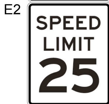
Assembly of S5-2 sign (24x30) & R2-1 sign (24x30) [MUTCD specifies that a "resume" speed limit sign is always paired with the end school zone sign]