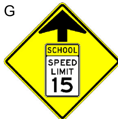
S4-5 sign (36x36)