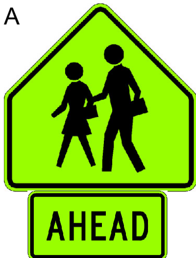
S1-1 sign (36x36) & W16-9P placard (24x12) [placed 100m before B]