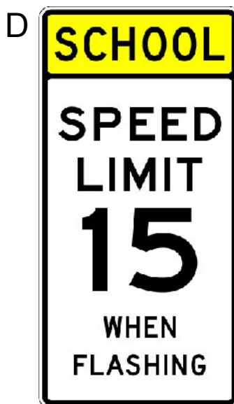
S5-1 sign (24x48), with one or two flashing yellow lights [can be single sign or assembled out of S4-3, R2-1 and S4-4]