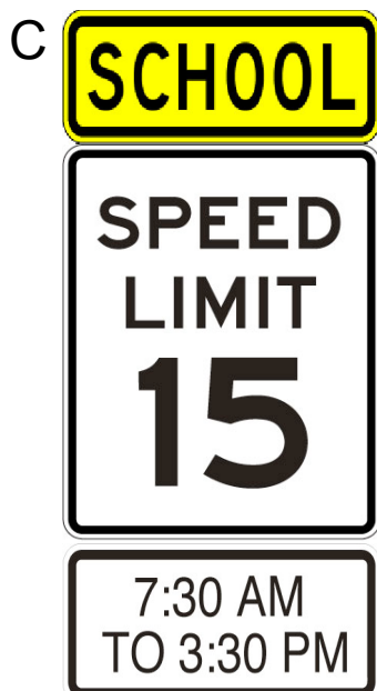
S4-3 placard (24x8) & R2-1 sign (24x30) & S4-1 placard (24x10) [time varies]