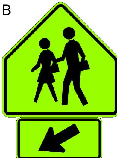
S1-1 sign (36x36) & W16-7P placard (24x12)