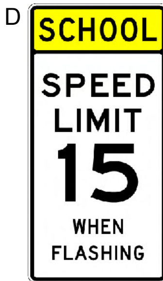
S5-1 sign (24x48), with one or two flashing yellow lights [can be single sign or assembled out of S4-3, R2-1 and S4-4]